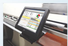
Touch Screen Monitor